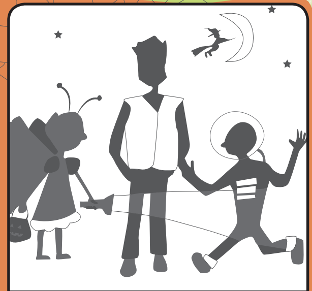
Color the vest and reflective trims bright yellow or orange so they can be seen at night.